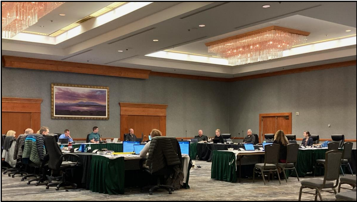
The North Pacific Fishery Management Council during the December meeting.

At their December meeting in the Anchorage Hilton, the North Pacific Fishery Management Council took measured steps to address chum salmon bycatch. The Council directed the newly formed Salmon Bycatch Committee to develop management recommendations for the Council to review at their April meeting, when salmon bycatch genetic studies will also be available. Over 40 individuals testified and 145 written comments submitted on the chum bycatch issue. Representatives of western Alaska